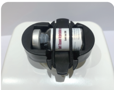
Plate specially made for Juvelook and Lenisna fits perfectly into the vortex body.